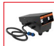
WIRED FOOT PEDAL